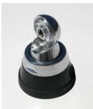
Zara base & cable complete. 90° Mounting option available.